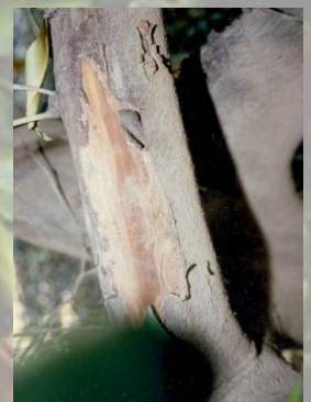
Cambium Anti-Stress Treated (left) vs. Non-Treated (right)